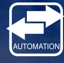
AUTOMATION INPUT / OUTPUT