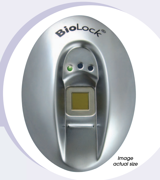
Image actual size

"...this amazing product really makes keys a thing of the past."