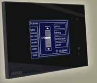
SC5000CT2,BK - without Logic Engine SC5000CTL2,BK - with Logic Engine