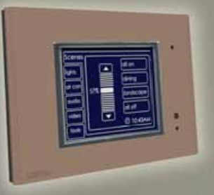
5080CT2-7 - without Logic Engine 5080CTL2-7 - with Logic Engine