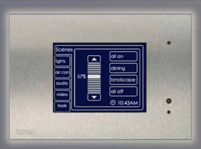
Super bright LCD screen with 50% more screen area than MKI.