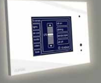
SC5000CT2,WE - without Logic Engine SC5000CTL2,WE - with Logic Engine