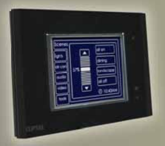
5080CT2-6 - without Logic Engine 5080CTL2-6 - with Logic Engine