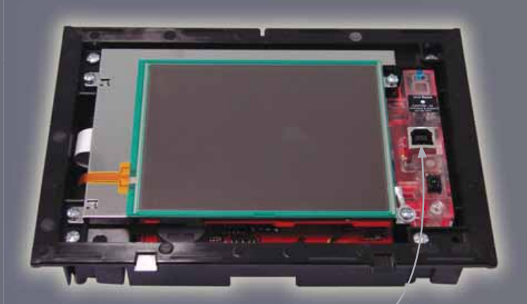
USB programming port accessible by removing the fascia.