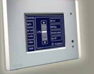
5050CT2-28 - without Logic Engine 5050CTL2-28 - with Logic Engine