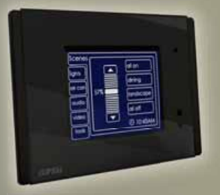
5050CT2,BK - without Logic Engine 5050CTL2,BK - with Logic Engine