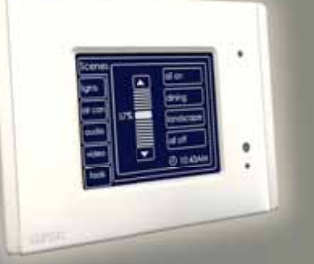
5050CT2,WE - without Logic Engine 5050CTL2,WE - with Logic Engine