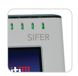
Prisma is also available with a SIFER reader built in.