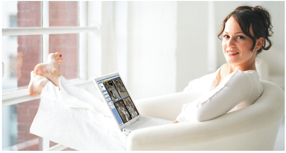
XProtect Essential is high-value, easy-to-use IP video management software