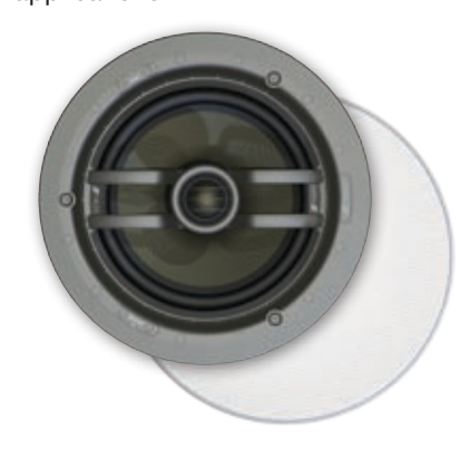
Packaged Individually with Round MicroThin™ Grille

For primary and secondary listening rooms and home theater applications