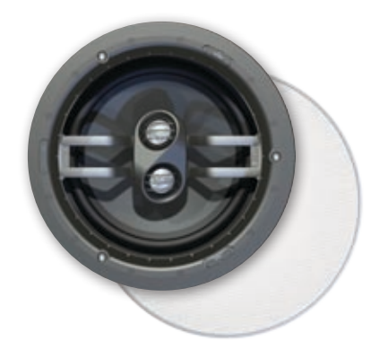
Packaged in Pairs with Round MicroThin™ Grilles

For surround effects in multi-channel home theater applications