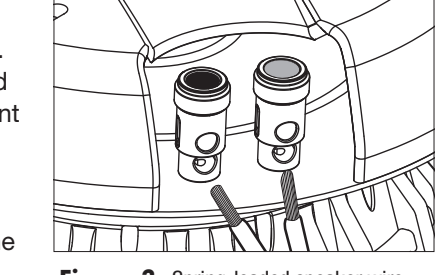
Figure 3. Spring-loaded speaker wire connectors.

8. The speaker has black and red spring-loaded connectors (Figure 3). Black is for the negative (-) wire and red for the positive (+). It is important to observe correct wiring polarity. If you have wire other than black and red, make sure you connect it the same on the amplifier end as the speaker end. Failure to do so will adversely affect the loudspeakers' performance.